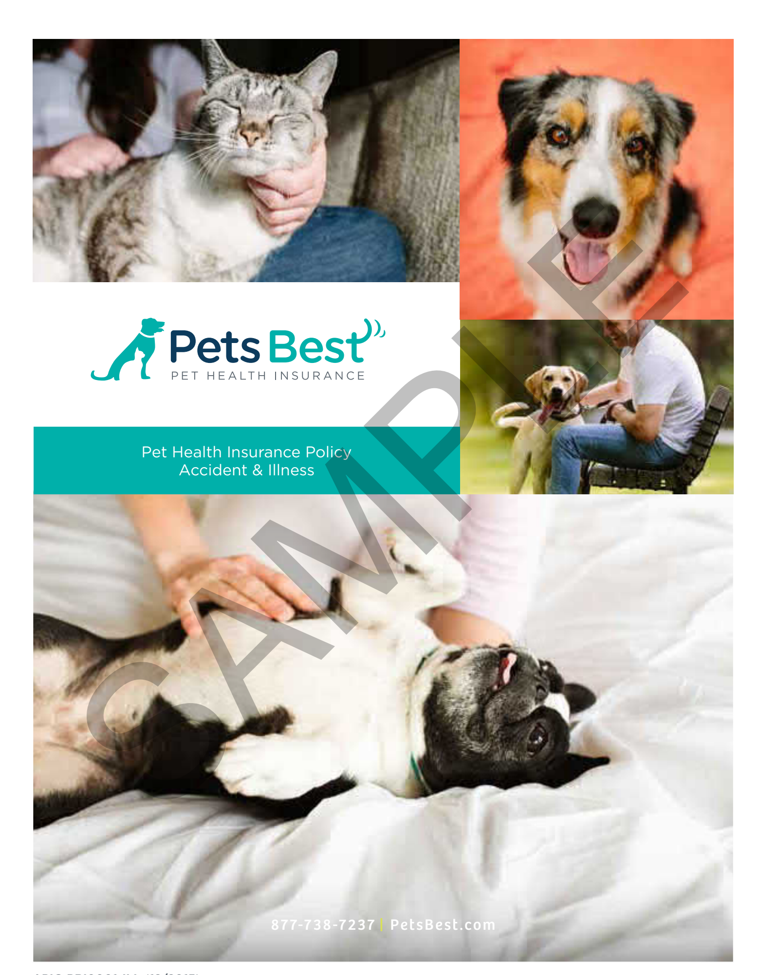
APIC-PBI0001-ILL (12/2015) Underwritten by American Pet Insurance Company